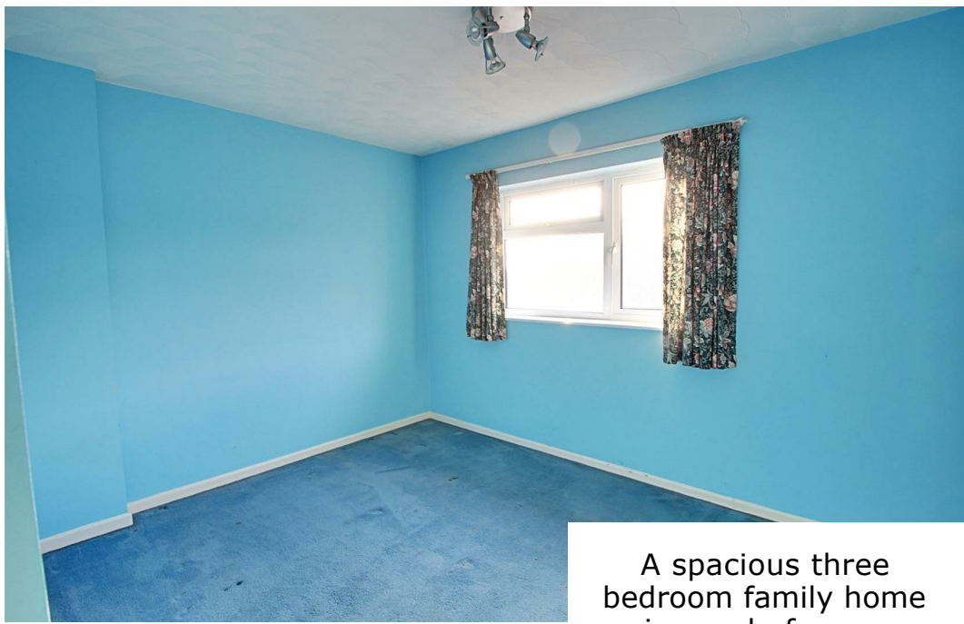
A spacious three bedroom family home in need of some refurbishment.